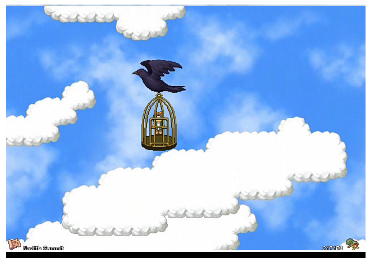
TRAVEL VIA CROW EXPRESS