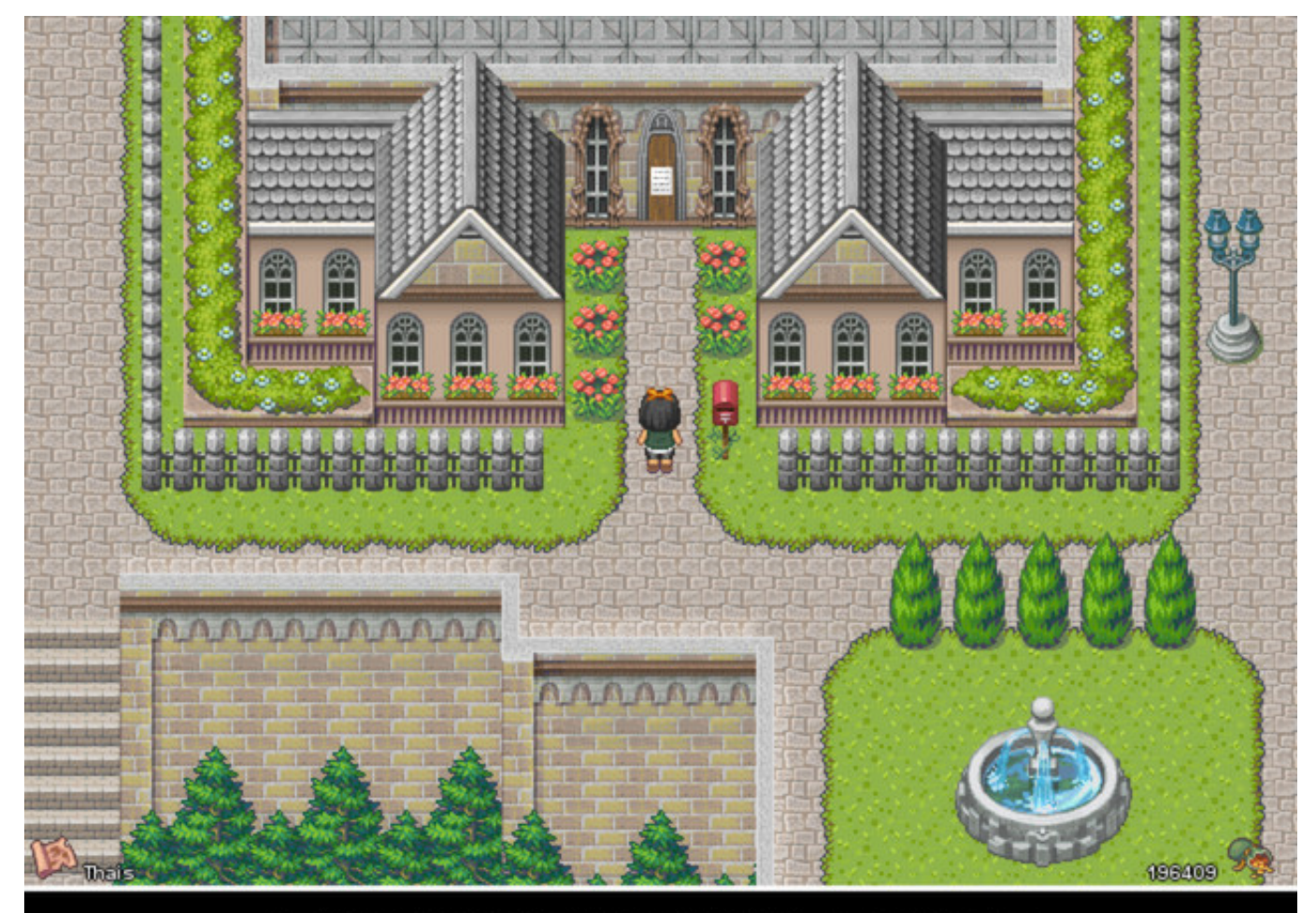
IT'S FOR RENT IF YOU CAN AFFORD IT.